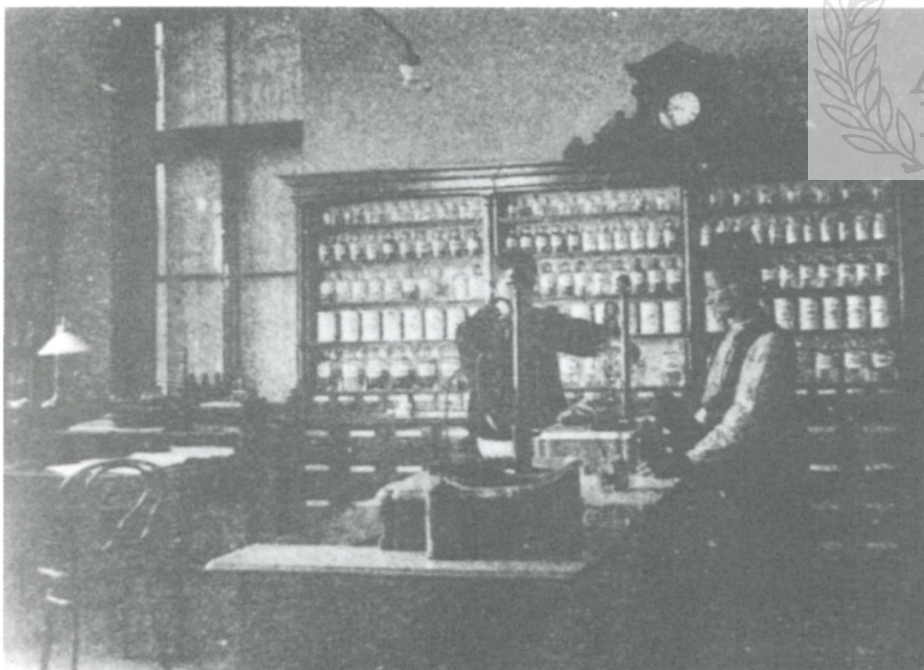
Fig. 6. Landesspital. Pharmacy