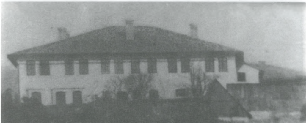
Fig 2. Muslim's Charitable Hospital when it was started.