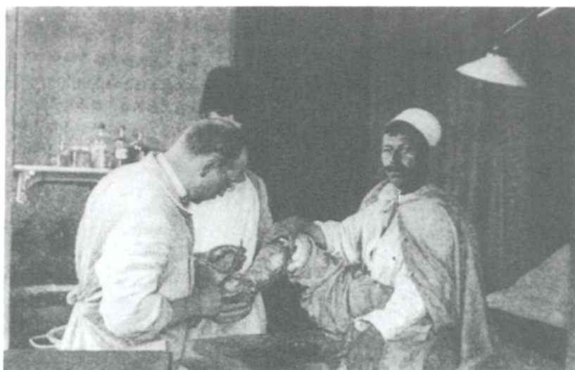
Fig. 3. Muslim's Charitable Hospital, Tgreating the burn of the calf.