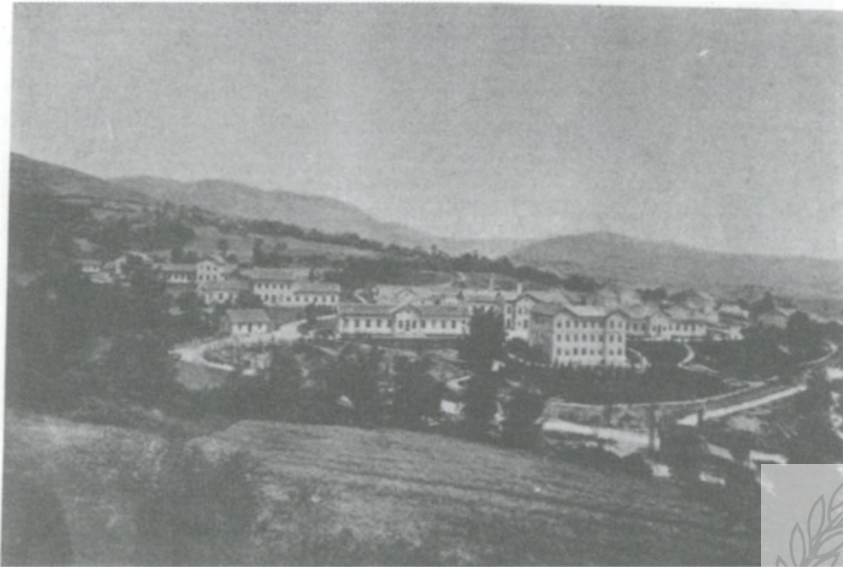
Fig. 1. Landesspital when it was started