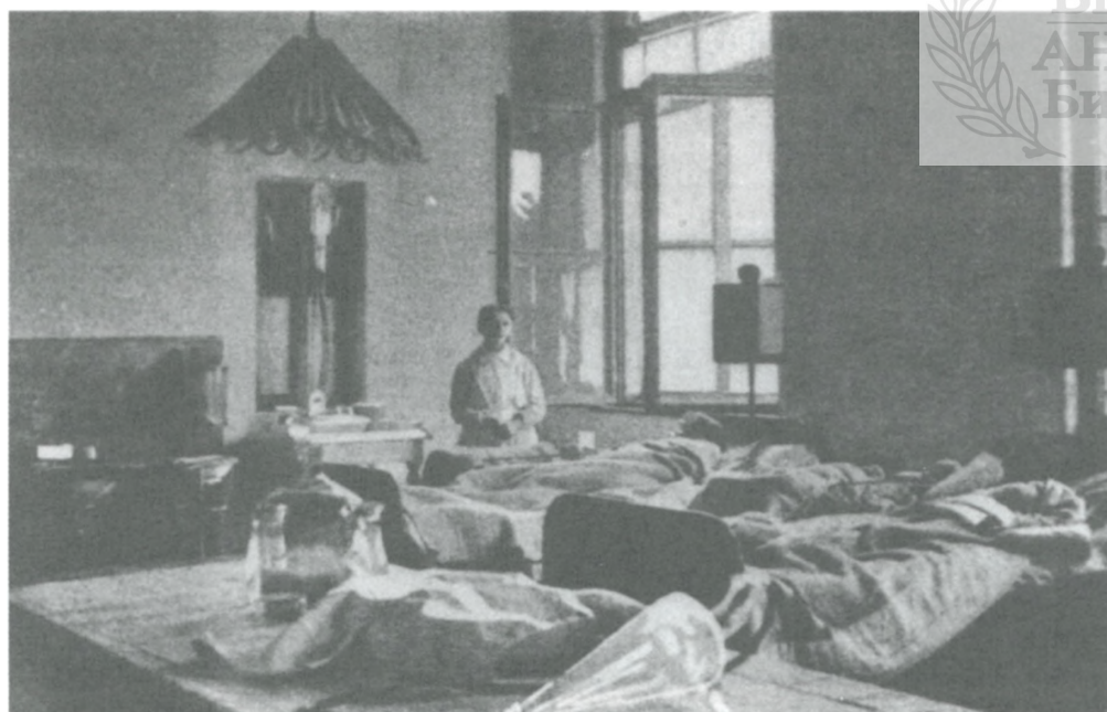
Fig. 4. Landesspital inside.