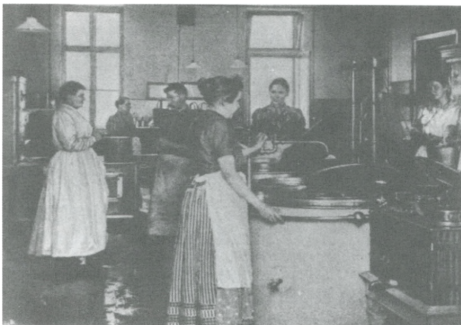
Fig. 5. Landesspital. Kitchen.