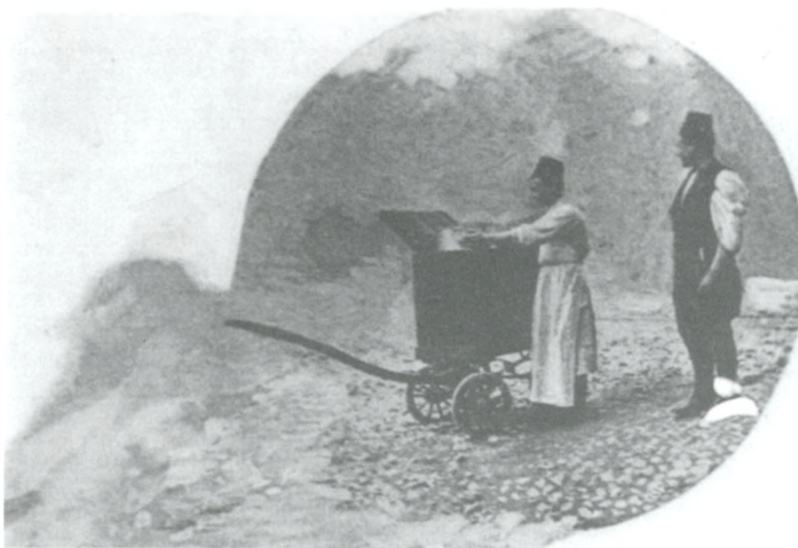
Fig. 7. Landesspital. Distribution of the food